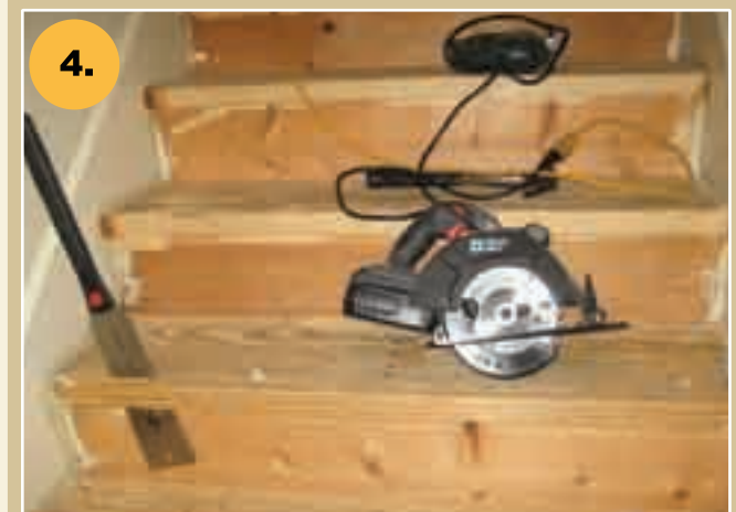
Cut the nosing using a circular saw and finish the cut with a flush cutting saw.