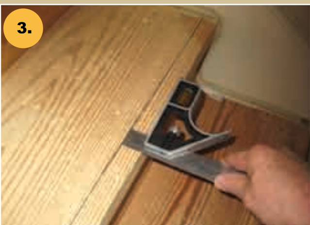
The nosing needs to be marked so that it can be cut and removed.