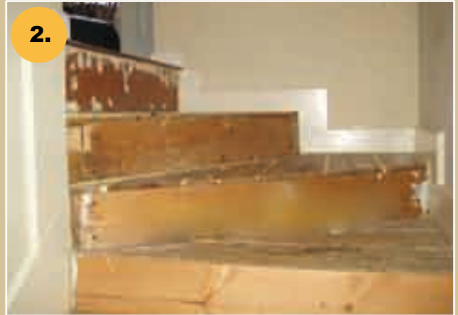
Begin by removing the carpet from your stairs, this will reveal the substructure